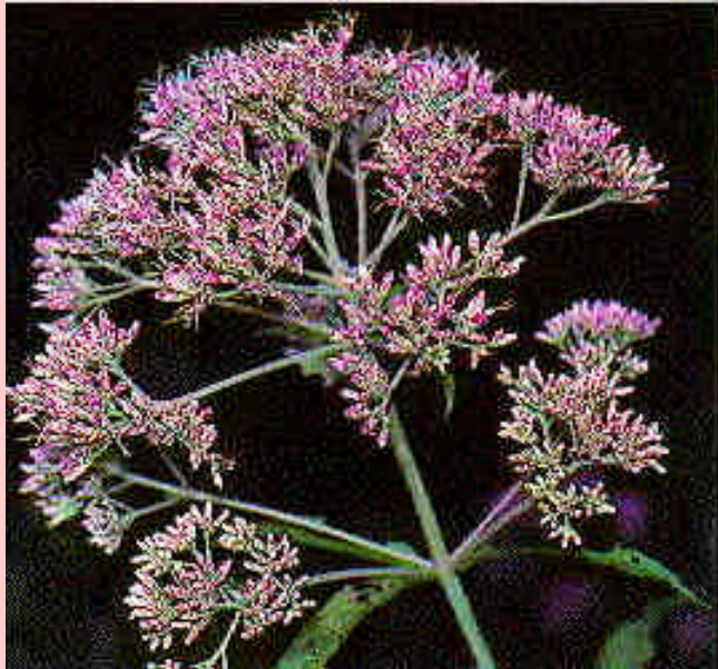
Joe Pye Weed (not really a weed)

Several varieties of attractive prairie and wetland plants thrive in rain gardens.