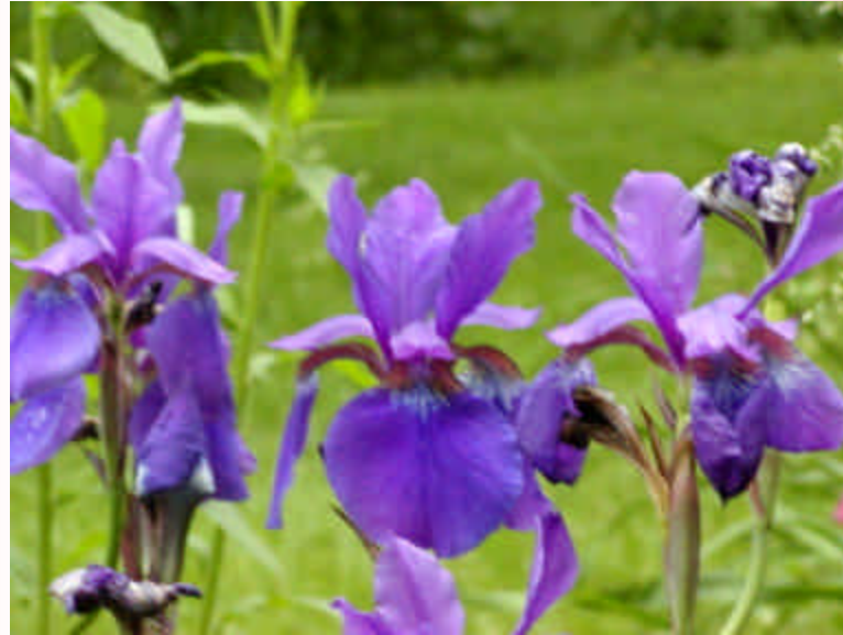
blue flag iris

Rain gardens enhance aesthetics while protecting local water quality.